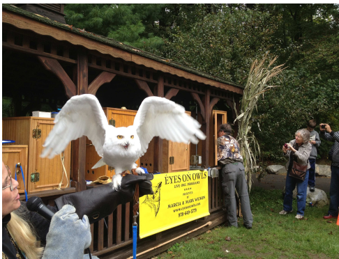
SNOWY OWL, "Eyes on Owls" presentation sponsored By SAVE at Breakheart's Fall Festival

Also on September 30 th , SAVE sponsored the "Eyes on Owls" event (see photos below). Comments from attendees at this event ranged from "fabulous" to "phenomenal" and everyone not only learned more about these regal creatures, but thoroughly enjoyed themselves in the process.